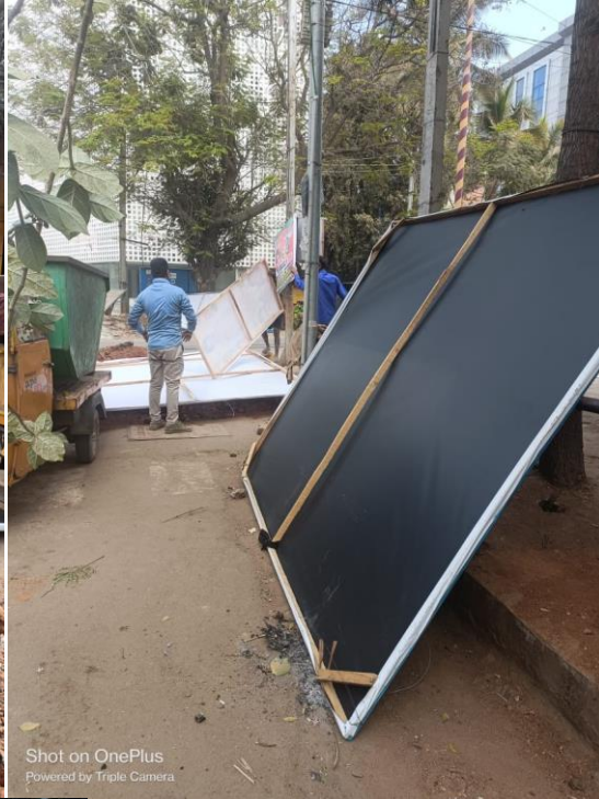
Shot on OnePlus Powered by Triple Camera