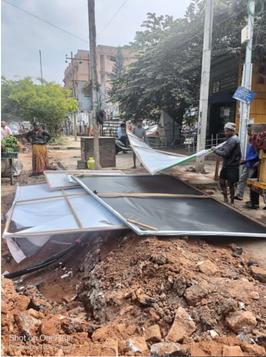
Shot on OnePlus Powered by Triple Camera